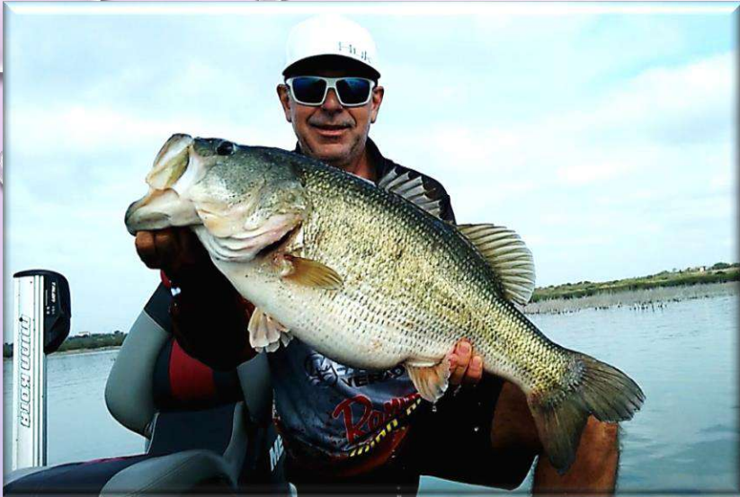
6.620 kg - 20 Feb 2016