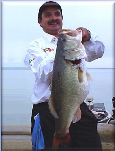
6.425 kg - 18 Nov 2012